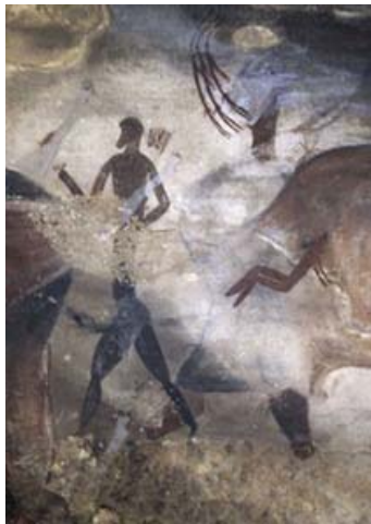
Rock art paintings in Dabous, Niger