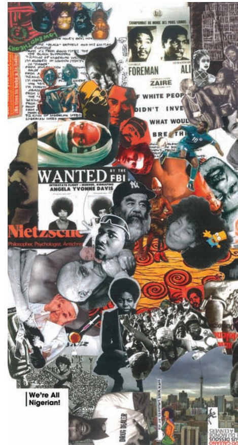
Cover detail: Chimurenga 8: We're All Nigerian! © Chimurenga, 2005